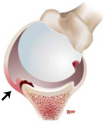
Labral and capsular tear