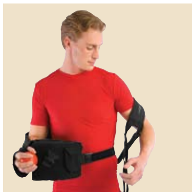
Put on de-rotational strap like a backpack.