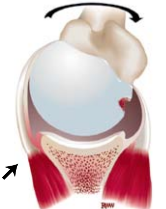
Bankart lesion reduced with the arm in External Rotation in the USER