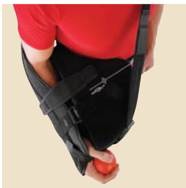
Top view Position the white line parallel to the front of the body for indicated external rotation.